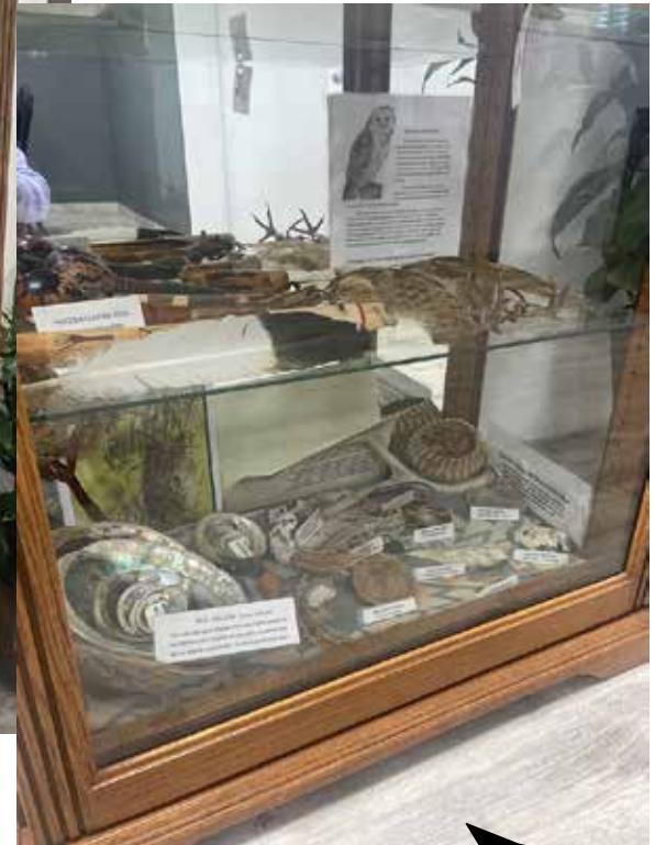
Located in the Tribal Office