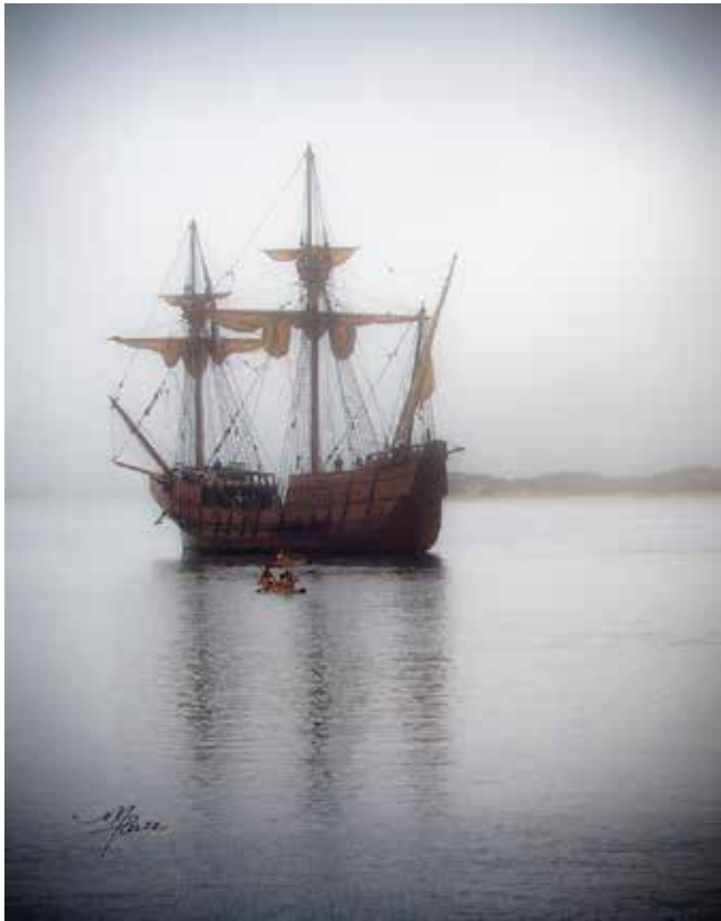
Photo of the 2016 Reenactment

For more info check out: morrobaymaritime.org