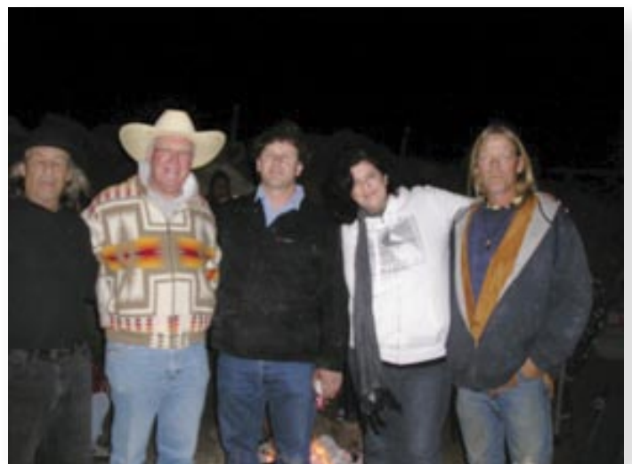
Wishing Rock of Light