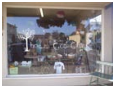
"Three Eco Chicks"