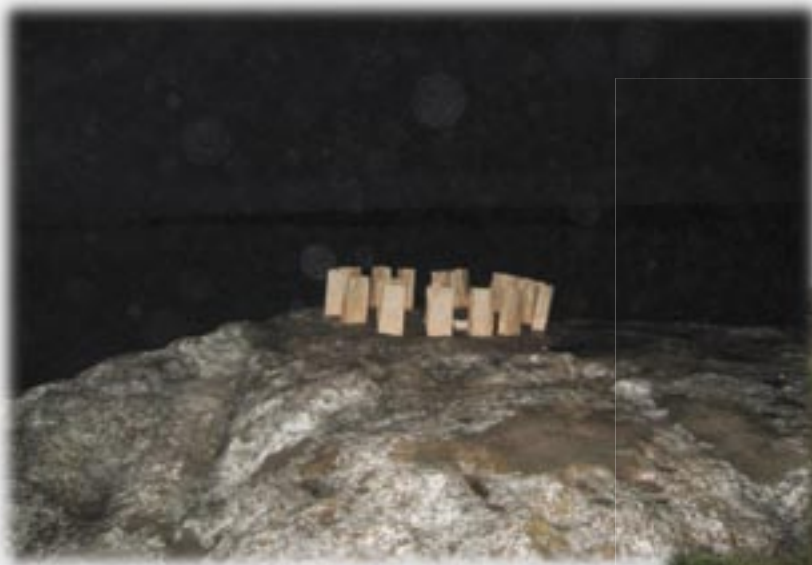
Wishing rock of light