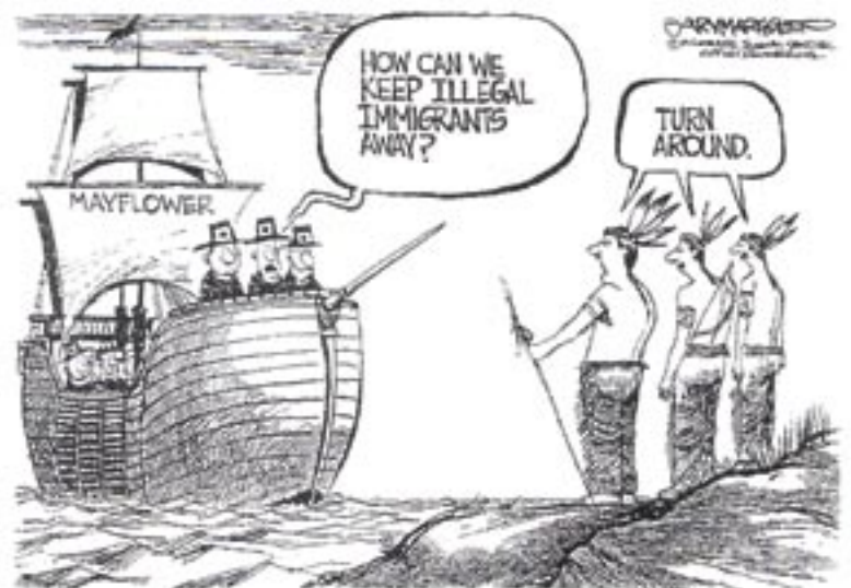
Fighting Terrorism since 1492